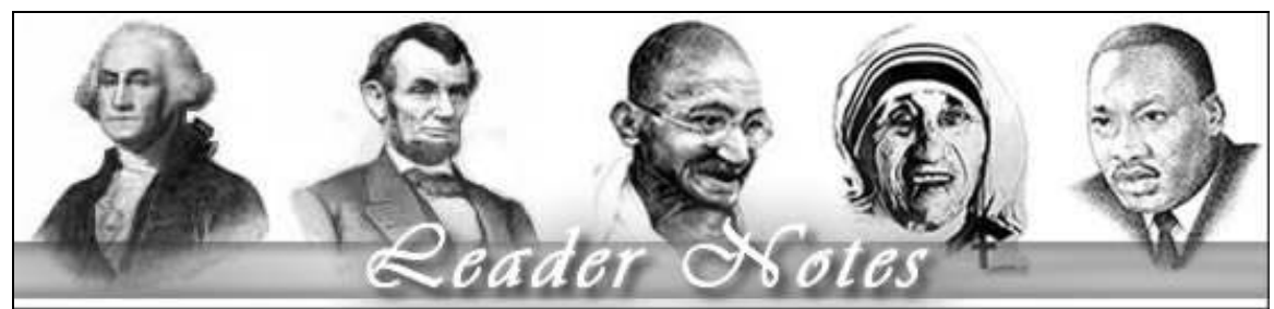
Leadership - A discussion of traits, characteristics, and current news of leaders.